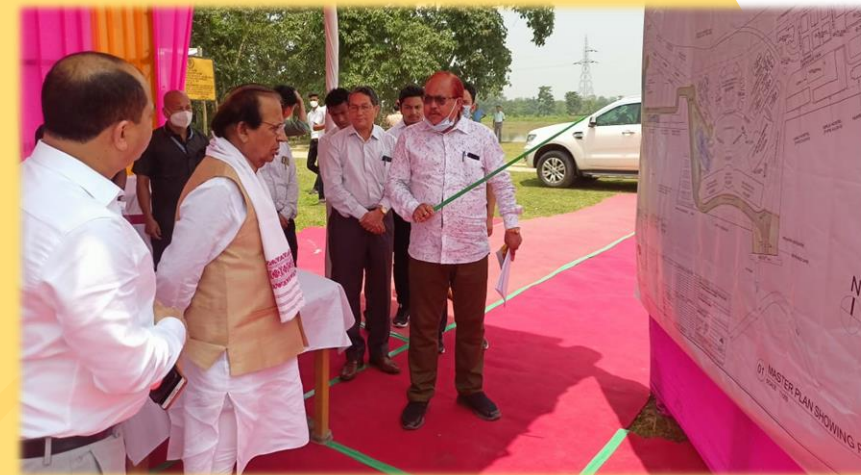
The the Hon'ble Governor of Assam and Chancellor of the Majuli University of Culture visited the permanent site of the University on 30.05.2022