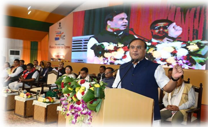
Foundation Stone Laying Ceremony of the Permanent Buildings of the Main Campus on 11.12.2022 by Hon'ble Chief Minister of Assam Dr. Himanta Biswa Sarma