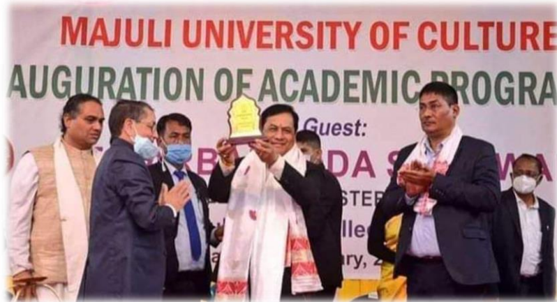
The then Hon'ble Chief Minister of Assam, Sjt. Sarbananda Sonowal inaugurated the Academic Programmes of the Majuli University of Culture on 13.07.2018.